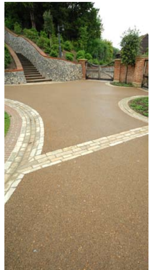
Natural coloured asphalt subtly yet stylishly enhances it's surroundings

This can be summarised as efficient building which also encompasses whole life carbon footprint and value engineering.