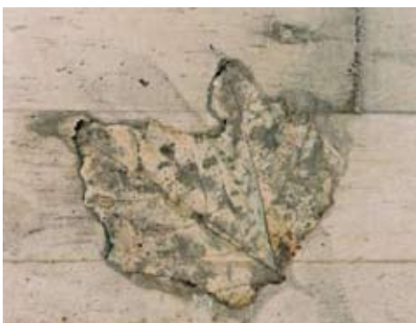
Agilia™ with leaf imprint

Globally the group leads in cement, concrete and aggregates and in the UK operates over 200 quarries, wharves, and concrete and asphalt plants. With an already well established market leading contracting business, focussing on highways infrastructure and airfields projects, Lafarge Construction Solutions adds an exciting